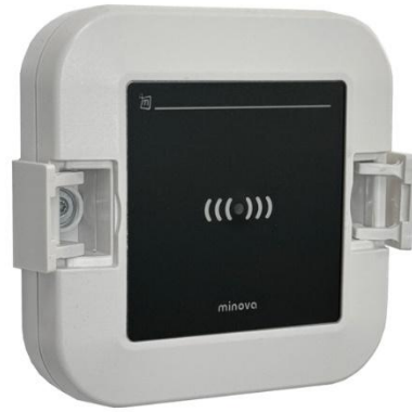
Blind lids for wall mounting